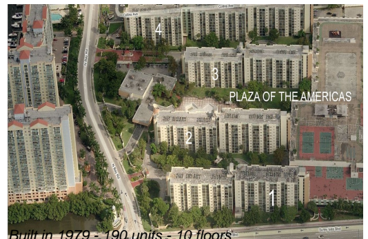
Built in 1979 - 190 units - 10 floors