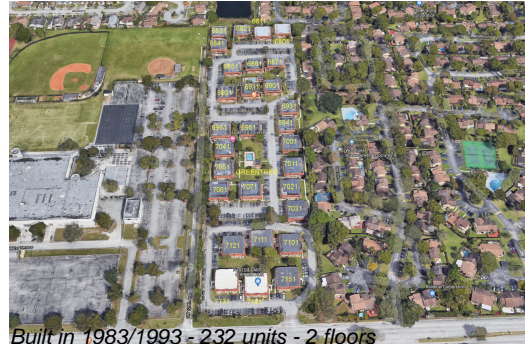
Built in 1983/1993 - 232 units - 2 floors