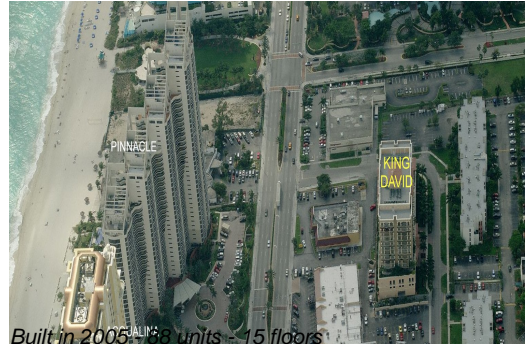
Built in 2005 - 88 units - 15 floors