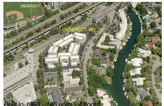
Built in 1990 - 146 units - 4 floors