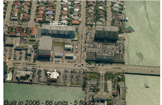
Built in 2006 - 66 units - 5 floors