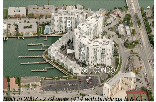
Built in 2007 - 279 units (414 with buildings B & C) - 15 floors