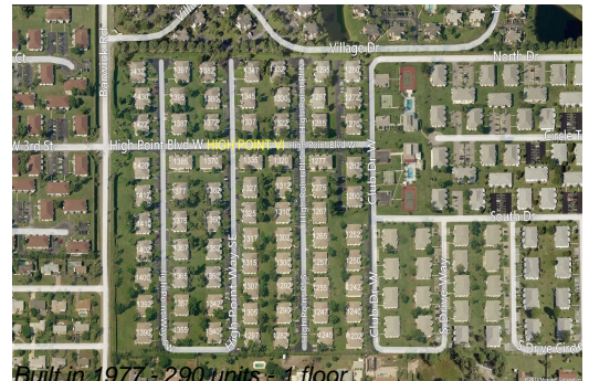
Built in 1977 = 290 units = 1 floor