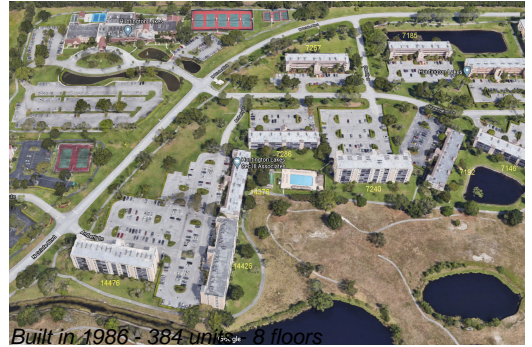
Built in 1986 - 384 units - 8 floors