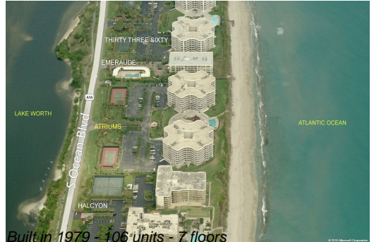
Built in 1979 - 406 units - 7 floors