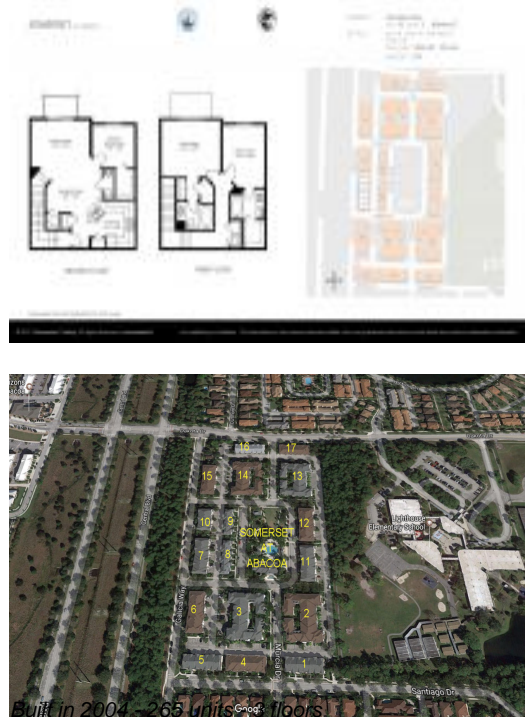
Built in 2004 - 265 units, 11 floors