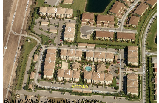
Built in 2005 - 240 units - 3 floors