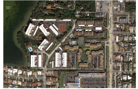
Built in 1979/1990 - 246 units - 5 floors

Costa Del Sol Owners Association 5801 North Banana River Blvd #958 Cape Canaveral, FL 32920 Phone: 321-799-4575 Fax: 321-799-4510 costadelsol@cfl.rr.com https://www.costadelsolcc.org/