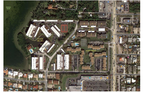
Built in 1979/1990 - 246 units - 5 floors

Costa Del Sol Owners Association 5801 North Banana River Blvd #958 Cape Canaveral, FL 32920 Phone: 321-799-4575 Fax: 321-799-4510 costadelsol@cfl.rr.com https://www.costadelsolcc.org/