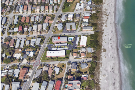
Built in 1980 - 30 units - 2 floors