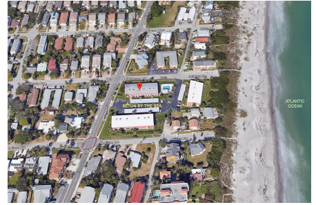
Built in 1980 - 30 units - 2 floors