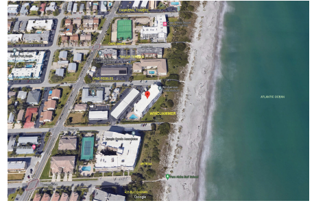
Built in 1973 - 48 units - 6 floors

Windjammer Condominium Address: 555 Fillmore Ave #101, Cape Canaveral, FL 32920 Phone: +1 321-784-8011 (321) 783-4252