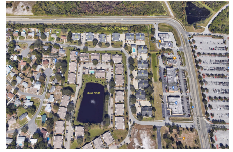
Built in 1987 - 48 units - 1 floor