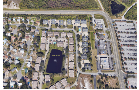
Built in 1987 - 48 units - 1 floor