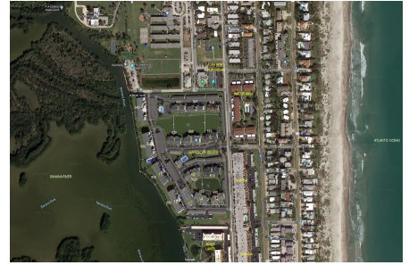
Built in 1986 - 252 units - 4 floors

Harbor Isles 1 & 2 510-680 S. Brevard Avenue Cocoa Beach, FL 32931 Prestige Property Management – 321.501.0654 Maintenance Items 321.220.5200 https://harborislescondo.website/