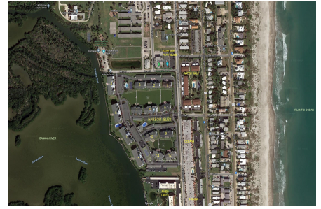
Built in 1986 - 252 units - 4 floors

Harbor Isles 1 & 2 510-680 S. Brevard Avenue Cocoa Beach, FL 32931 Prestige Property Management – 321.501.0654 Maintenance Items 321.220.5200 https://harborislescondo.website/