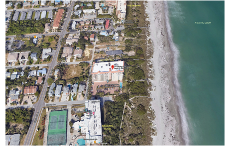
Built in 2006 - 39 units - 8 floors

Michelina Condominium Associates Address: 422 Harding Ave, Cocoa Beach, FL 32931 Phone: +1 321-783-0032 Vesta Property Services 907 E Strawbridge Ave, Suite 104 Melbourne, FL 32901 Phone (321) 241-4946 Email info-sc@vestapropertyservices.com Fax (321) 610-1021 https://michelinacondos.com/