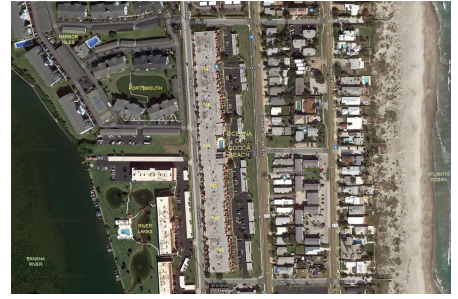
Built in 1989 - 96 units - 1 floor

Oceana of Cocoa Beach Address: 750 S Orlando Ave, Cocoa Beach, FL 32931 Phone: +1 321-799-4001