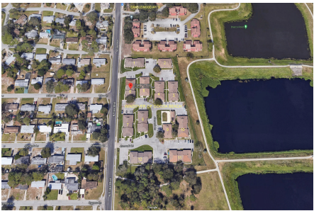
Built in 1981 - 68 units - 2 floors