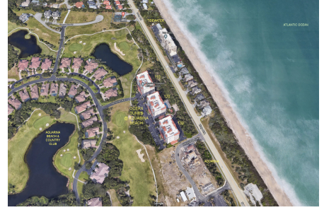
Built in 2008 - 84 units - 8 floors

Ocean Dune At Aquarina Condo Address: 140 Warsteiner Way, Melbourne Beach, FL 32951 Phone: +1 321-728-3291 https://www.oceandunesataquarina.com/