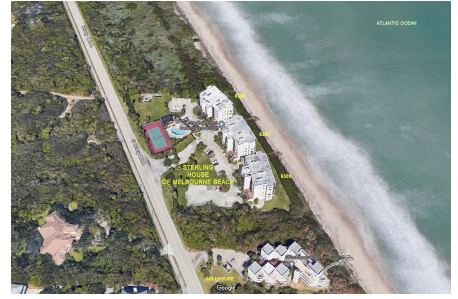
Built in 1980 - 45 units - 6 floors

Sterling House Owners Association Address: 6305 S Hwy A1A, Melbourne Beach, FL 32951 Phone: +1 321-723-2256