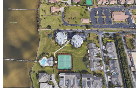
Built in 1989 - 20 units - 5 floors

Wexford Property Owners Association Address: 209 Ballyshannon St, Melbourne Beach, FL 32951 Phone: +1 321-674-9982