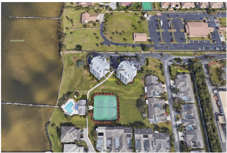
Built in 1989 - 20 units - 5 floors

Wexford Property Owners Association Address: 209 Ballyshannon St, Melbourne Beach, FL 32951 Phone: +1 321-674-9982