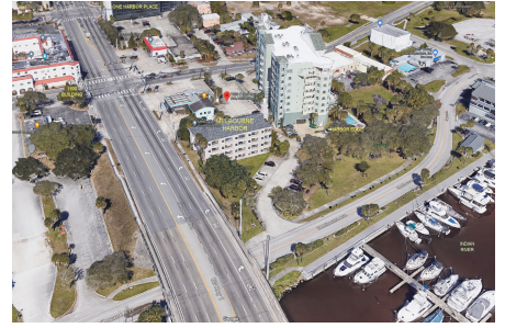
Built in 1984 - 20 units - 4 floors

Number of units: 20 Number of active listings for rent: 2 Number of active listings for sale: 0 Building inventory for sale: Number of sales over the last 12 months: 0% Number of sales over the last 6 months: 0 Number of sales over the last 3 months: 0