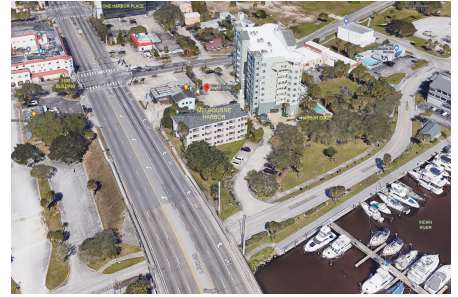
Built in 1984 - 20 units - 4 floors