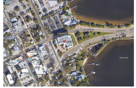
Built in 2007 - 33 units - 8 floors

PINEAPPLE HOUSE CONDOMINIUM ASSOCIATION, INC 7145 TURNER ROAD SUITE 101 ROCKLEDGE, FL 32955