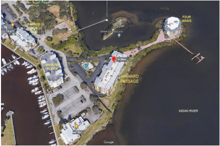
Built in 1984 - 28 units - 4 floors

Windward Passage Condominium Association, Inc. 2260 Front St Melbourne, FL 32901 Phone: (321) 727-0692