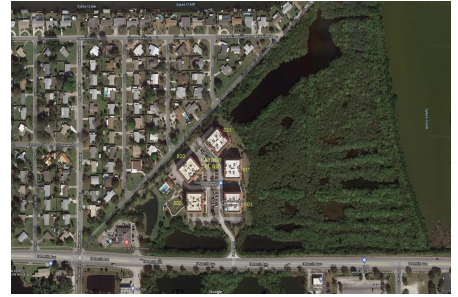
Built in 2004 - 94 units - 6 floors

Harbor Del Rio Condominium Association BP Davis Management (321) 784-2091 bpdavis@bpdavis.com https://www.hdrmifl.com/