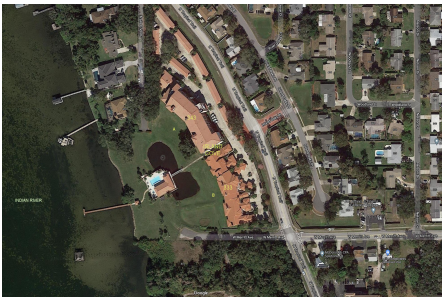
Built in 1990/2003 - 42 units - 4 floors

Island Cove Condominiums Address: 333 N Tropical Trail, Merritt Island, FL 32953 Phone: +1 321-454-3283