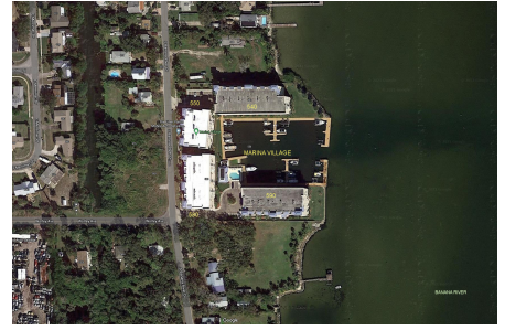
Built in 2005 - 54 units - 3 floors

Marina Village Address: 540 S Banana River Dr, Merritt Island, FL 32952 Phone: +1 321-452-0367