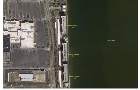
Built in 1989 - 224 units - 8 floors

Merritt Towers Inc Address: 300 S Sykes Creek Pkwy, Merritt Island, FL 32952 BP Davis Property Management, Inc. 321-784-2091