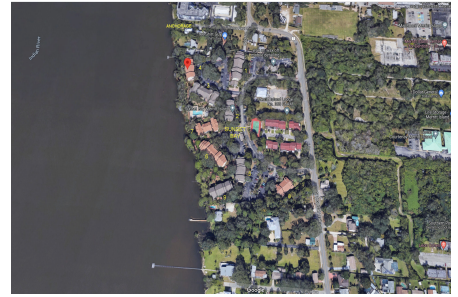
Built in 1986 - 192 units - 3 floors