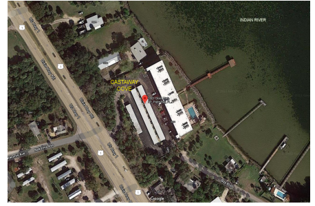
Built in 1985 - 50 units - 5 floors

Castaway Cove Condominium Association 3901 Dixie Hwy, NE Palm Bay, FL 32905 (865) 924-4238