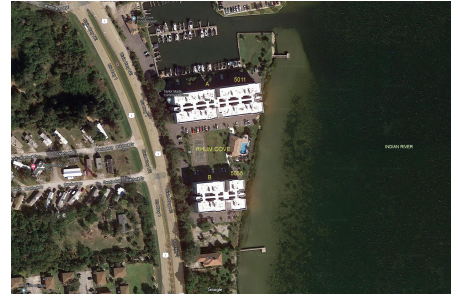
Built in 1988 - 72 units - 4 floors

Rhum Cove Condominium Association Address: 5001 Dixie Hwy NE, Palm Bay, FL 32905 Phone: +1 321-951-4149