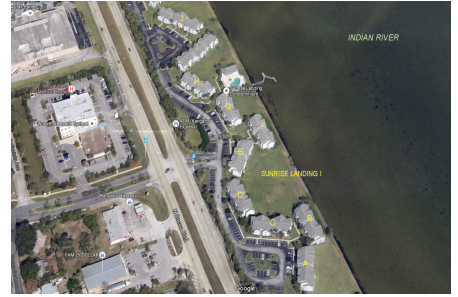
Built in 1986 - 88 units - 2 floors

Sunrise Landing Condominium Association Address 7350 N Highway 1 Cocoa, Florida 32927 Phone +1 321-639-3360