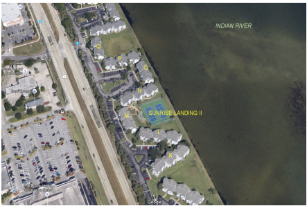
Built in 1986 - 72 units - 2 floors

Sunrise Landing Condominium Association Address 7350 N Highway 1 Cocoa, Florida 32927 Phone +1 321-639-3360