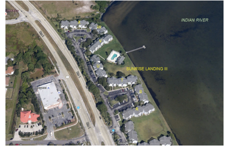
Built in 1986 - 76 units - 2 floors

Sunrise Landing Condominium Association Address 7350 N Highway 1 Cocoa, Florida 32927 Phone +1 321-639-3360