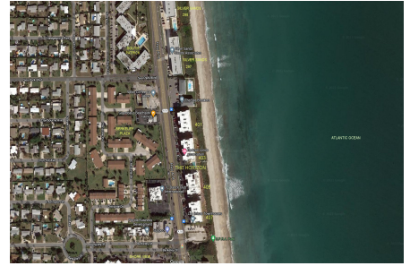
Built in 1987 - 83 units - 6 floors

East Horizon condominium Association, Inc. 401, 403, 405 & 407 Highway A1A, Satellite Beach, FL 32937 Vesta Property Services formerly Oceanside Property Management info-sc@vestapropertyservices.com 2040 Highway A1A, Suite 208 Indian Harbour Beach, FL 32937 P: 321.241.4946 F: 321.610.1021 www.VestaPropertyServices.com