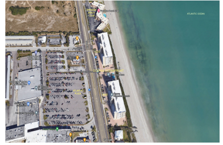
Built in 2019 - 108 units - 10 floors

Oceana Oceanfront Condo Address: 1045 Florida A1A, Satellite Beach, FL 32937 Phone: +1 321-614-2942