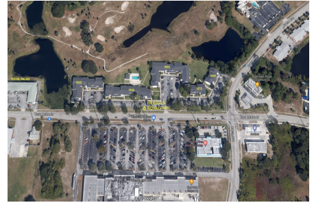
Built in 1981 - 96 units - 2 floors

Number of units: 96 Number of active listings for rent: 0 Number of active listings for sale: 0 Building inventory for sale: Number of sales over the last 12 months: 0% Number of sales over the last 6 months: 0 Number of sales over the last 3 months: 0