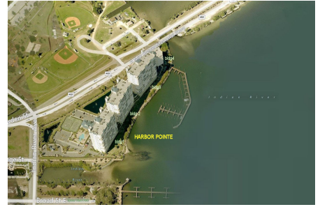
Built in 2005 - 68 units - 12 floors

Number of units: 68 Number of active listings for rent: 0 Number of active listings for sale: 0 Building inventory for sale: Number of sales over the last 12 months: 0% Number of sales over the last 6 months: 0 Number of sales over the last 3 months: 0