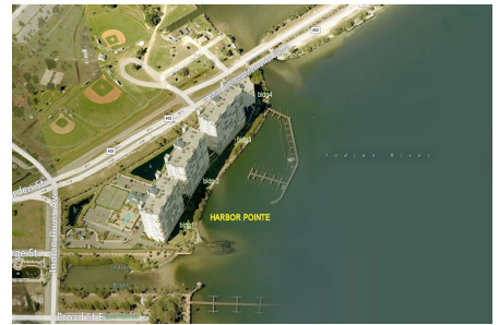
Built in 2006 - 70 units - 12 floors