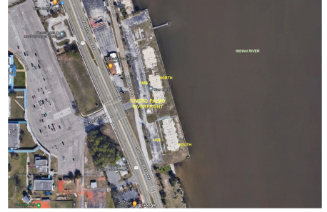
Built in 2022 - 50 units - 6 floors