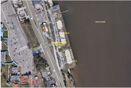
Built in 2022 - 50 units - 6 floors