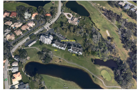
Built in 1990 - 30 units - 3 floors

Number of units: 30 Number of active listings for rent: 0 Number of active listings for sale: 0 Building inventory for sale: Number of sales over the last 12 months: 0% Number of sales over the last 6 months: 0 Number of sales over the last 3 months: 0