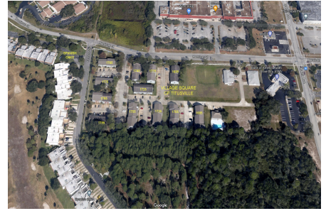
Built in 1983/1988 - 104 units - 2 floors

Village Square of Titusville Address: 1655 Harrison St, Titusville, FL 32780 Phone: +1 321-269-4250