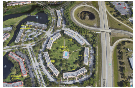
Built in 1989 - 256 units - 4 floors

Abaco Village Condo Association 1310 Avenue Of The Stars Coconut Creek, FL 33066 Phone: (954) 978-2620