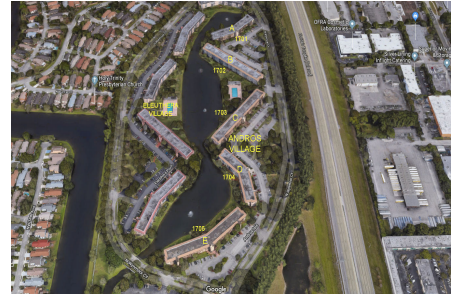
Built in 1987 - 248 units - 4 floors

Andros Village Condominium Association, Inc. Address: 1310 Ave of the Stars, Coconut Creek, FL 33066 Wynmoor Community Council, Inc. 1310 Avenue of the Stars Coconut Creek, Florida 33066 954-978-2600