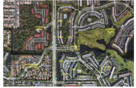
Built in 1979/1981 - 528 units - 4 floors

Antigua Village I Condominium Association, Inc. Address: 1310 Ave of the Stars, Coconut Creek, FL 33066 ANTIGUA VILLAGE II CONDOMINIUM ASSOCIATION, INC 1310 AVENUE OF THE STARS COCONUT CREEK, FL 33066-1453