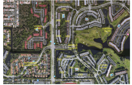
Built in 1979/1981 - 528 units - 4 floors

Antigua Village I Condominium Association, Inc. Address: 1310 Ave of the Stars, Coconut Creek, FL 33066 ANTIGUA VILLAGE II CONDOMINIUM ASSOCIATION, INC 1310 AVENUE OF THE STARS COCONUT CREEK, FL 33066-1453