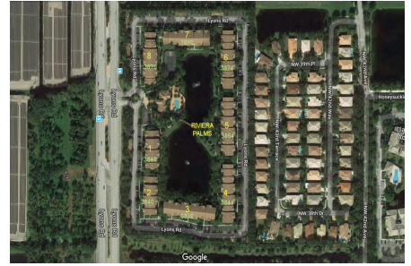
Built in 2001 - 248 units - 3 floors