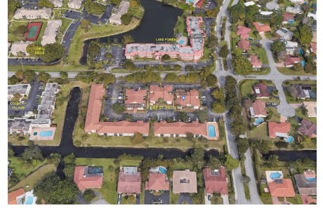
Built in 1983 - 56 units - 2 floors

Forest Park South li Condominium Association Of Coral Springs, Inc. Address: 7932 Wiles Rd, Coral Springs, FL 33067