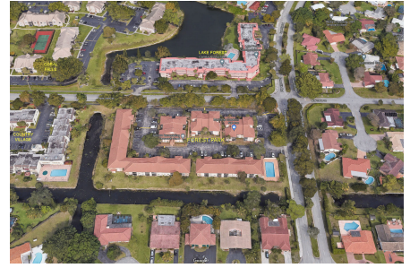
Built in 1983 - 56 units - 2 floors

Forest Park South li Condominium Association Of Coral Springs, Inc. Address: 7932 Wiles Rd, Coral Springs, FL 33067