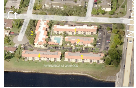
Built in 1984 - 52 units - 2 floors

RIVERS EDGE AT OAKWOOD CONDOMINIUM INC. PHOENIX MANAGEMENT SERVICES INC 3082 JOG RD GREENACRES FL 561-296-0198